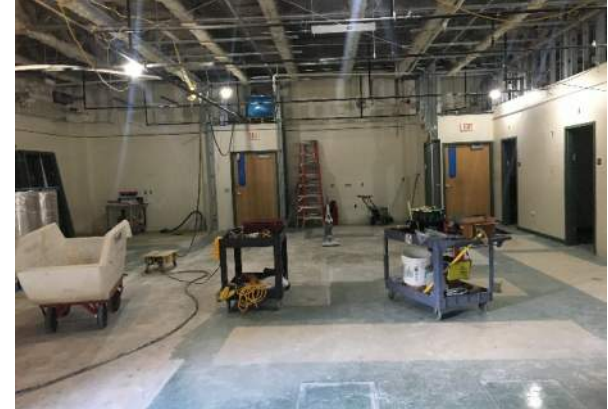
The walls in the old High Point area are no longer there! There will soon be a new layout.