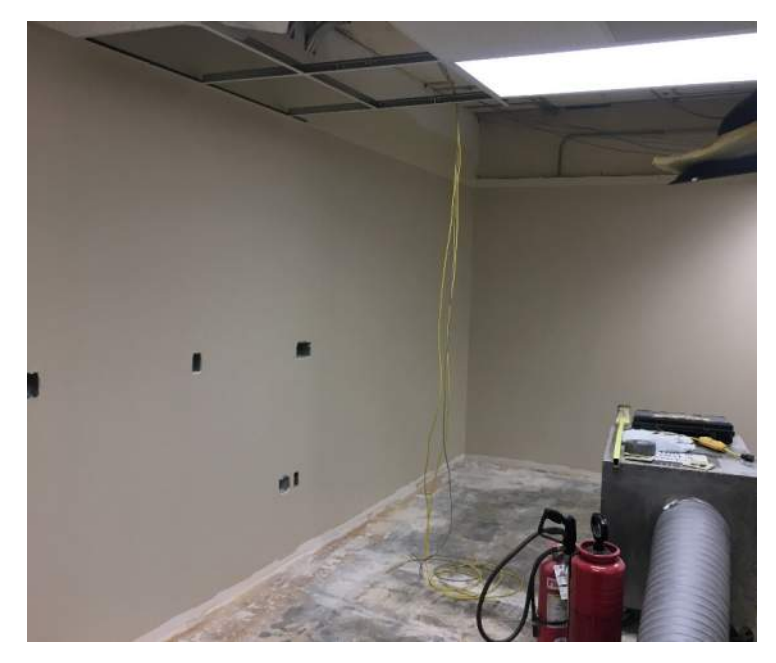
The walls and ceiling are prepped for the install of the booth. The ceiling grid and tiles are removed to allow for the booth to be installed and connected as needed.