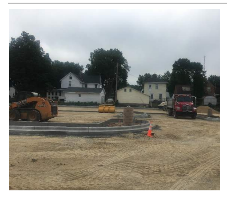
Curb and gutter being installed in the new parking lot. The asphalt and then the striping are the next steps in the process.