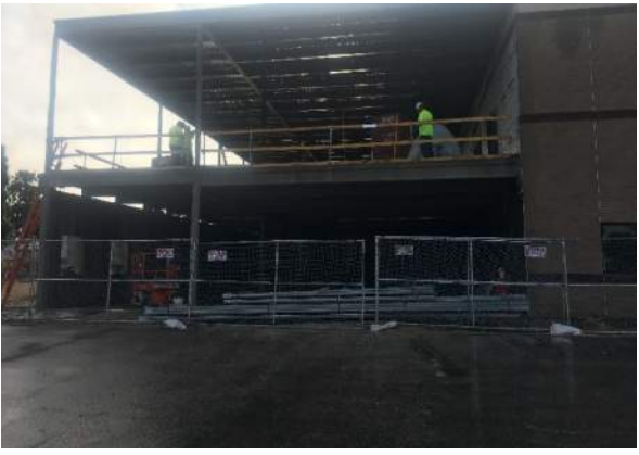
The new electrical room has the wall framing up, and will soon be drywalled and painted.