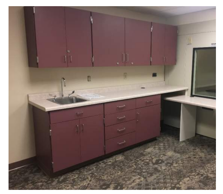
After the booth is installed, paint, flooring, and countertops and cabinets are installed. Almost ready to open for business!