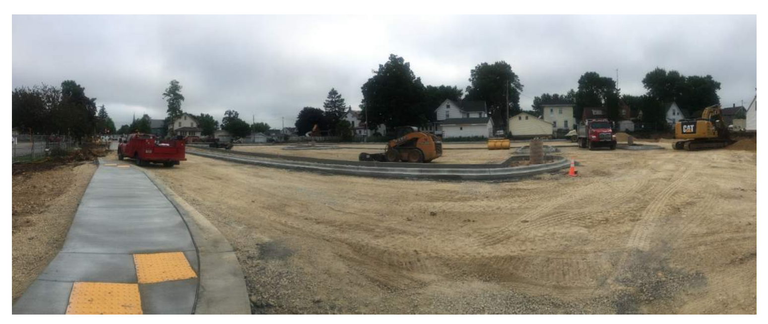
A panoramic view of the parking lot being worked on before it can be asphalted, striped, and opened up for use! The curb and gutter as well as part of the sidewalk can be seen above.