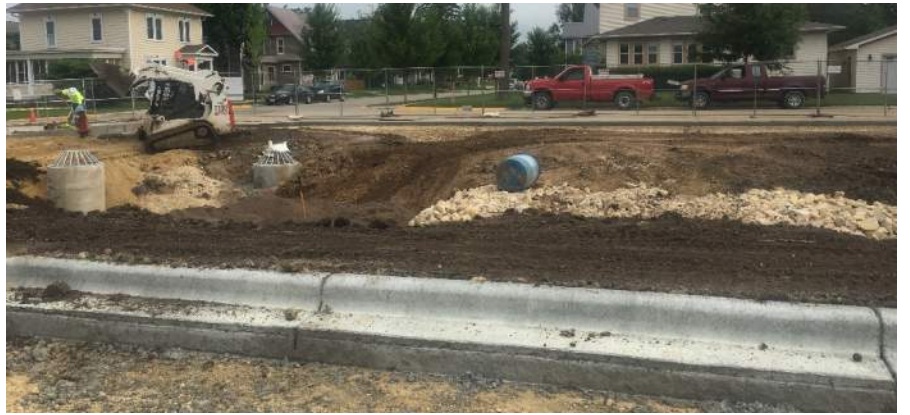
The new retention ponds and curb and gutter for the new parking lot are coming together nicely.