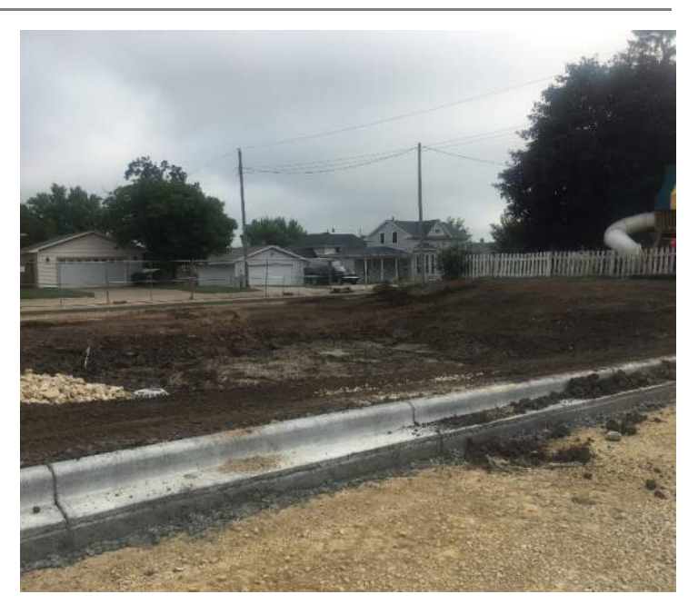
The new retention ponds that will be located to the north of the parking lot. These will take final shape in the next few weeks.